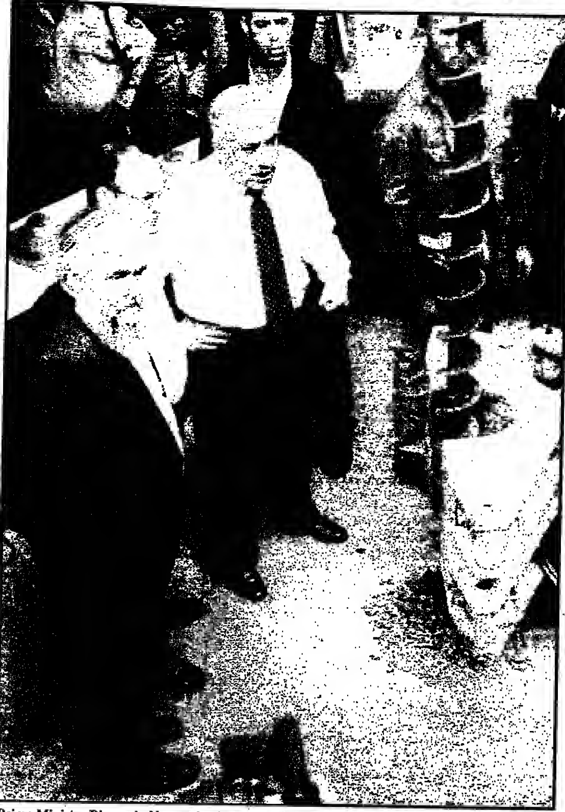
Prime Minister Binyamin Netanyahu (right), Tel Aviv Mayor Ronni Milo (center), and Transport Minister Yitzhak Levy look on as the machine test drilling for Tel Aviv's new subway goes into action. Story, Page 12.

"We are convinced of the move we took after a broad dialogue and would not go back on it," an official said.